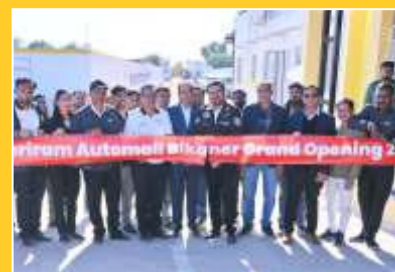
Shriram Automall Bikaner