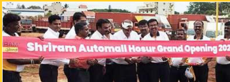
Shriram Automall Hosur