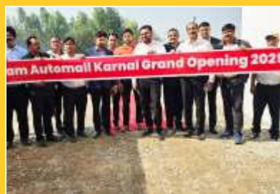
Shriram Automall Karnal