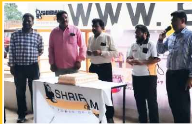
VIJAYAWADA AUTOMALL 22 nd JULY 2023