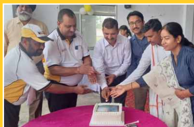
ALWAR AUTOMALL 26 th AUGUST 2023