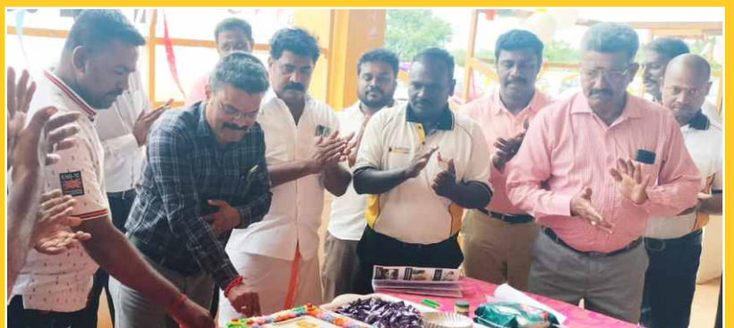
TRICHY AUTOMALL 26 th SEPTEMBER 2023