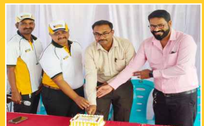
RATNAGIRI AUTOMALL 14 th SEP 2023