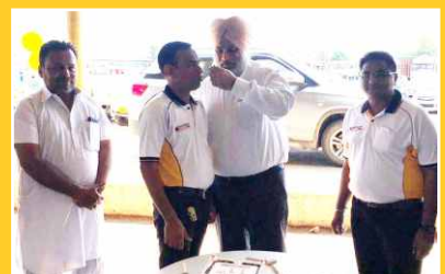
LUDHIANA AUTOMALL 21 st SEPTEMBER 2023