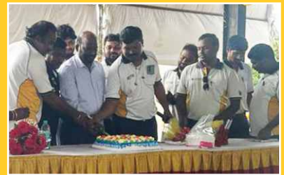
PATANCHERU AUTOMALL 29 th JULY 2023