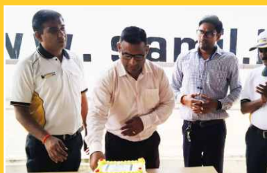
JABALPUR AUTOMALL 20 th SEPTEMBER 2023