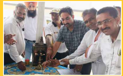
JODHPUR AUTOMALL 22 nd JULY 2023