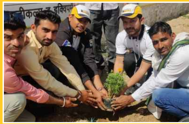
BHOPAL AUTOMALL 5 th JULY 2023