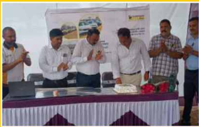
CHHATARPUR AUTOMALL 26 th JUNE 2023