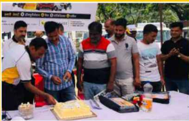
SHIMLA AUTOMALL 21 st MAY 2023