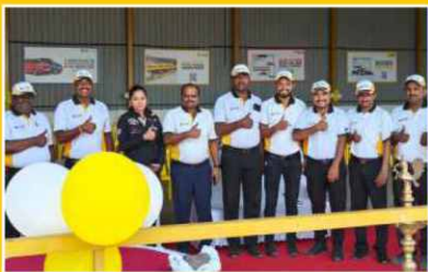
PUNE AUTOMALL 1 st JUNE 2023