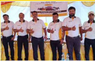
VARANASI AUTOMALL 27 th JUNE 2023