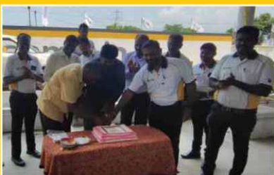
DINDIGUL AUTOMALL 17 th MAY 2023