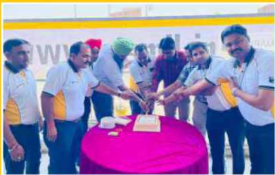
KARNAL AUTOMALL 19 th MAY 2023