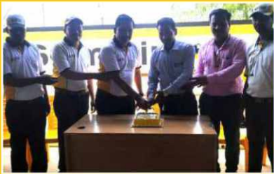
SOLAPUR AUTOMALL 15 th JUNE 2023