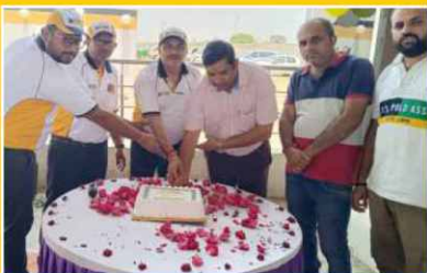
KANPUR AUTOMALL 30 th MAY 2023