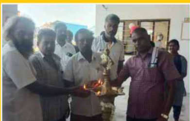
VELLORE AUTOMALL 16 th MAY 2023