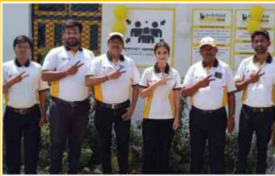
PRAYAGRAJ AUTOMALL 17 th JUNE 2023