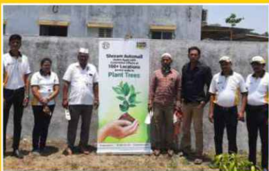
NASHIK AUTOMALL 22 nd MAY 2023