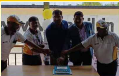
LATUR AUTOMALL 14 th JUNE 2023