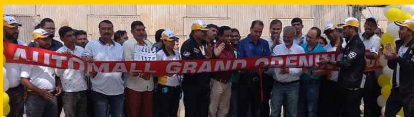
Guwahati Automall 25 th February 2023