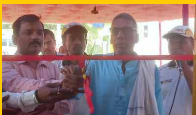
Purnea Automall 29 th July 2022