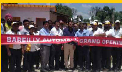
Bareilly Automall 13 th July 2022