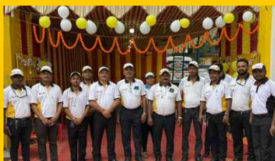
Barasat Automall 15 th June 2022