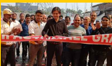
Muzaffarpur Automall 25 th February 2023