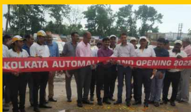
Kolkata Automall 21 st September 2022