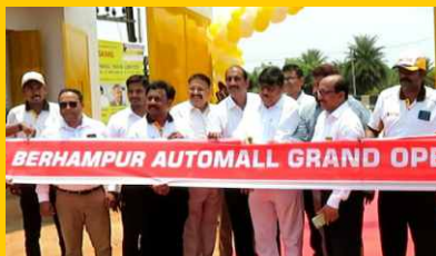
Berhampur Automall 27 th April 2022