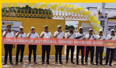
Chhatarpur Automall 24 th June 2022