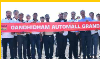
Gandhidham Automall 21 st December 2022