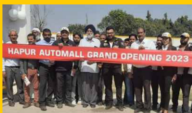
Hapur Automall 25 th February 2023