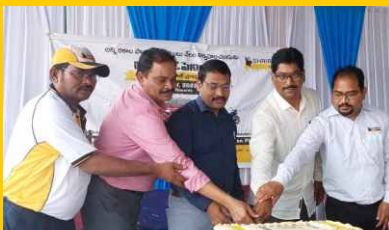
Proddatur Automall 12 th May 2022