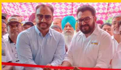
SGTN Office 15 th July 2022