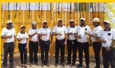
Prayagraj Automall 18 th June 2022